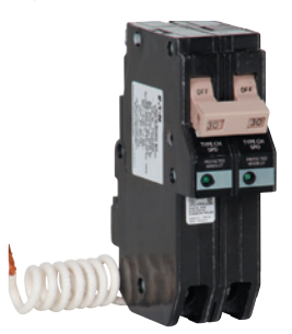
Complete Home Surge Circuit Breaker (Internally mounted to your breaker box)