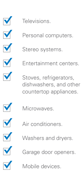
How much can you afford to lose? Don't limit your protection to only a surge strip, protect the entire home.