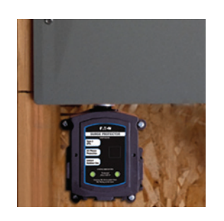
Easy. Installation is simple and is compatible with any manufacturers breaker box.