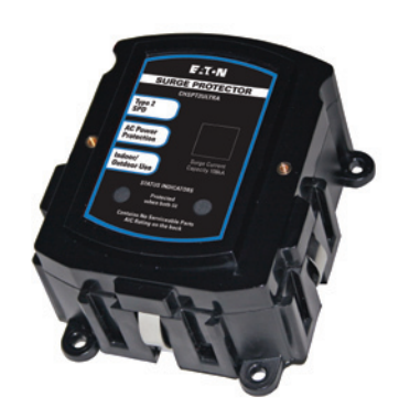
Complete Home Surge Protector (Externally mounted to your breaker box)