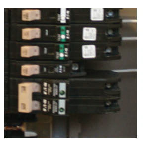
Flexibility. Surge protection plus a functional 2-pole circuit breaker.