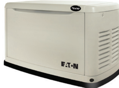
Eaton Standby Generator (installed)