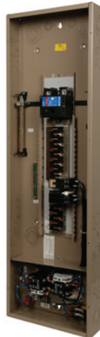
CH36B200EGPK (Complete unit, includes cover)