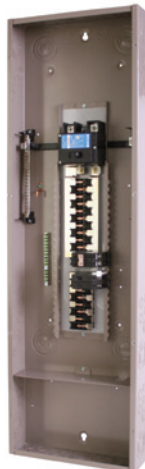
CH36B200EGP (Cover included)