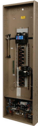
CH36B200EGPK (Complete unit, includes cover)